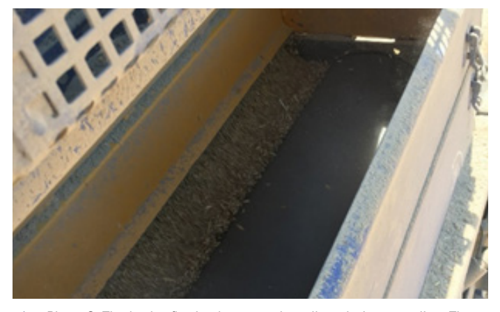
Photo 2. The barley flowing between the rollers during sampling. The roller temperature may need to be monitored to make sure it does not exceed 65 °C. Using a gap of 0.8mm the roller temperature remained between 48-50 °C.