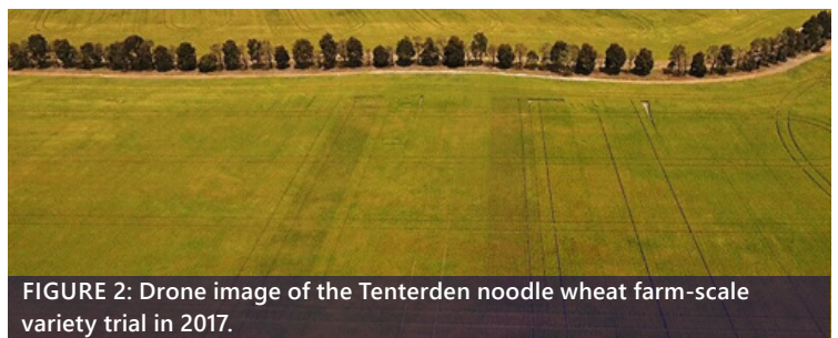
FIGURE 2: Drone image of the Tenterden noodle wheat farm-scale variety trial in 2017.