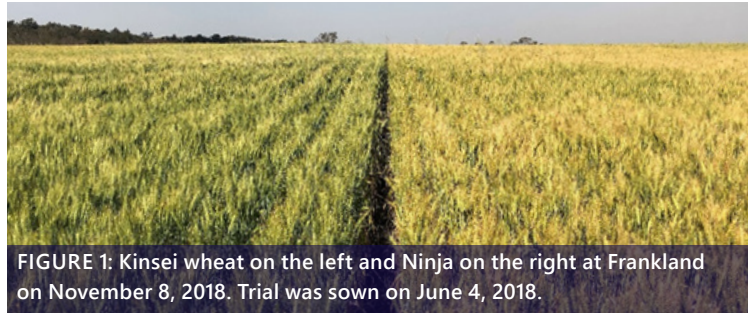
FIGURE 1: Kinsei wheat on the left and Ninja on the right at Frankland on November 8, 2018. Trial was sown on June 4, 2018.